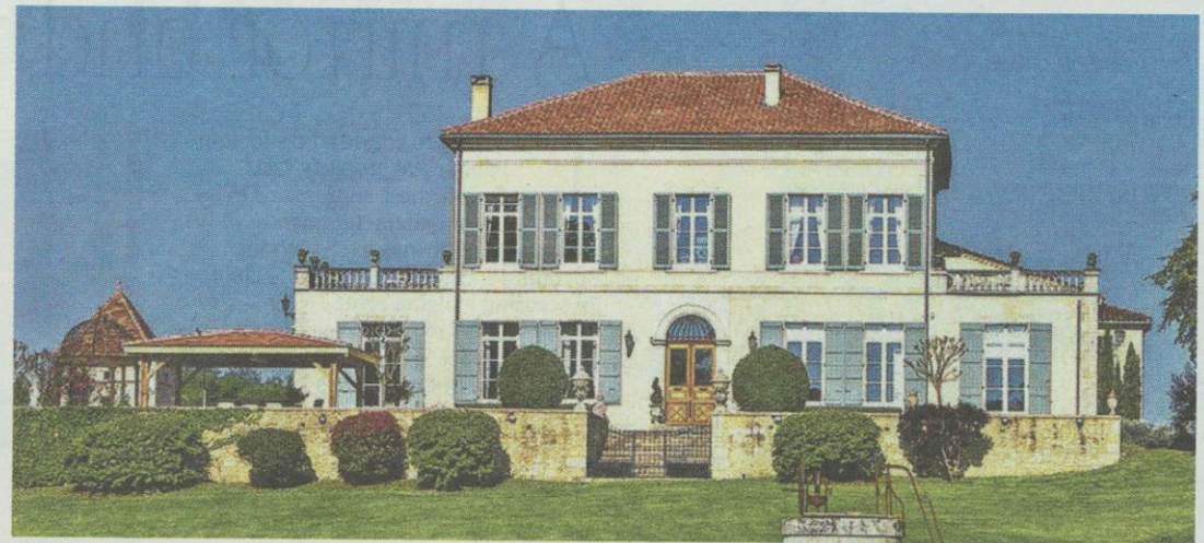
This seven-bedroom chateau in Condom, Gascony, is on sale for €2.25 million through Laffargue and Charles

In the Gers you can buy a rambling estate with a pool, a guest house, a commercially successful vineyard and substantial forest for the price of a one-bedroom flat in Chelsea, southwest London. For example, near the village of Éauze, half an hour’s drive from the town of Condom, the estate agency Laffargue and Charles is selling an organic wine estate for €1.27 million (£1.14 million). The estate includes 30 hectares of woods and 14 hectares of white wine-producing grapes, of which a portion is used to make armagnac. The four-bedroom, four-bathroom house is rustic but well maintained and comes with a guesthouse and wine-making room with storage tanks. The most expensive property on the market, at €3 million, is also one of the region’s most historically important and is being sold by its aristocratic owner through Laffargue and Charles. It is the sprawling castle of Charles de Batz de Castelmoré d’Artagnan, the chief musketeer for Louis XIV and the man on which Dumas based the character in his novel. The 10th-century castle near the town of Lupiac, which retains its original medieval (and listed)